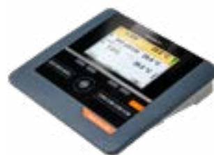
inoLab® Multi 9630 IDS