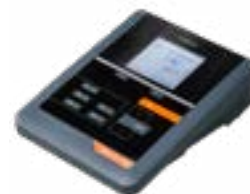
inoLab® Multi 9310 IDS