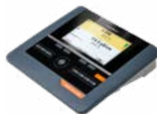
inoLab® Multi 9620 IDS