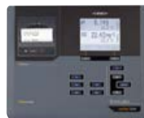
inoLab® pH/ION 7320P (with built-in printer)

The inoLab® pH/ION 7320 with two pH/mV/ISE inputs is perfectly suited for precision measurement and automatic GLP/AQA compliant documentation in quality laboratories of all industries. Also available with optional built in printer.