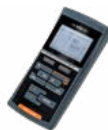
MultiLine® Multi 3510 IDS

The single-channel multi-parameter instrument Multi 3510 IDS is ideal for portable pH measurement in all conditions both outdoors and in a plant. Like all MultiLine® IDS meters, it is also suitable for pH measurement with cable lengths of up to 100 m.