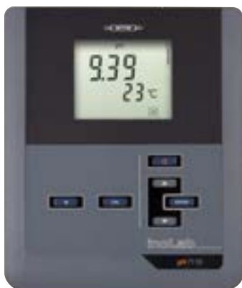
inoLab® pH 7110