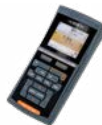
MultiLine® Multi 3620 IDS

Two galvanically isolated measurement channels, can be used simultaneously for identical or different parameters. Economic multi-parameter meter for many applications in which two parameters must be measured and/or stored simultaneously.