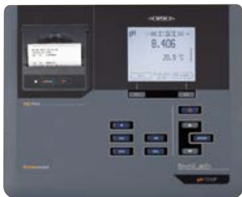
inoLab® pH 7310P (with built-in printer)