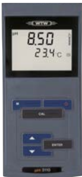
ProfiLine pH 3310