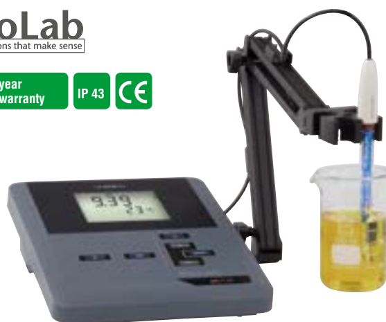
inoLab® pH 7110 SET 4