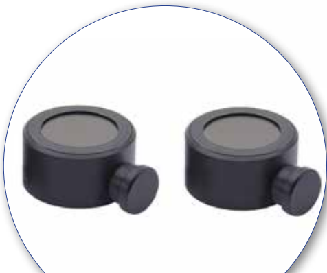
CL-17.1: Additional polarizing filters for CL-11.1