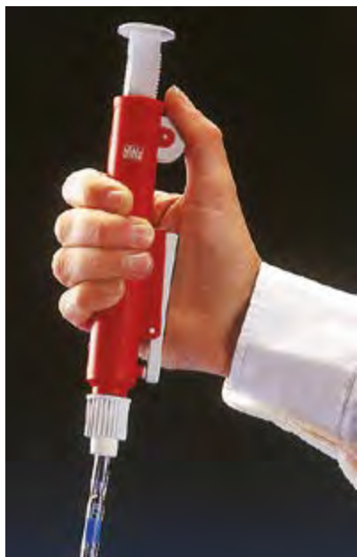
Suction via handwheel. If the handwheel is stopped, the piston remains in place and no liquid flows out