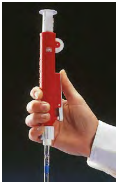
Discharge via outlet lever. Very small quantities can be removed with great accuracy by turning the handwheel

Proven thousands of time, fits naturally into the hand. The handwheel ensures precise suction. The contents can be purged by pressing back the piston. Dispensing with the lateral switch.